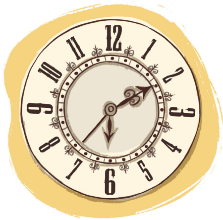
Measuring Time (using hours, minutes, and seconds)

In ancient times, Iraq was part of a large region called Mesopotamia, which is often called the “cradle of civilization” because of the many things invented there. Here are just a few.