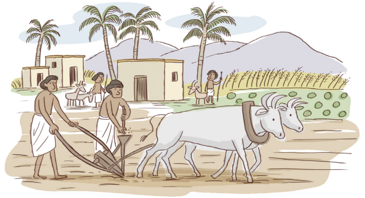
Farming (growing food to eat)