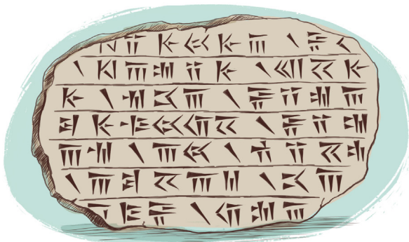
Cuneiform (the first form of writing)