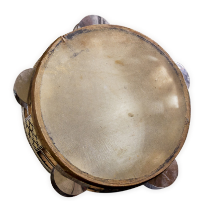
Riqq: A small hand drum with cymbals around it. It's a lot like a tambourine.